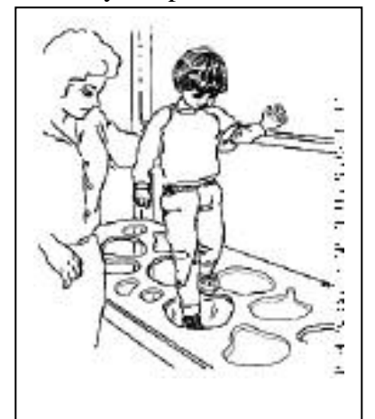
Fig. 1. Child coping with elevated "Swiss Cheese" board.

Helping the Children "Come Alive." At LCDC a number of strategies are used to help the children "come alive," to become aware of themselves and others and of their surroundings. These include "rough and tumble" play, and placing them in carefully supervised but challenging situations